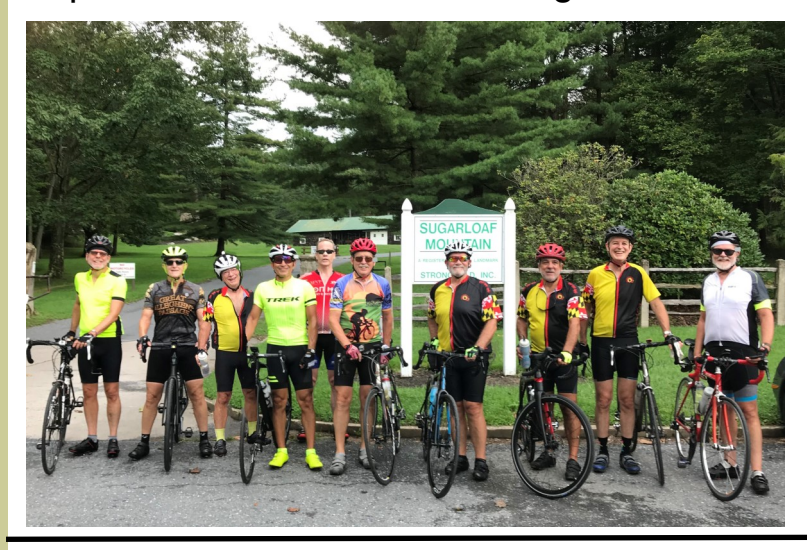
Thurmont Covered Bridges Ride