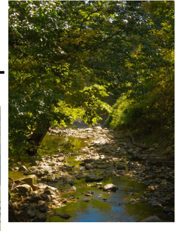
View from the third bridge