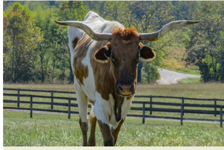
Move along you annoying bikers!