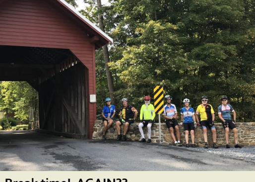
Break time! AGAIN??