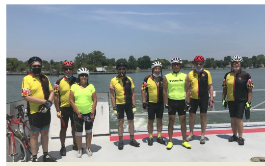
Oxford Ferry Ride, June 23, 2020