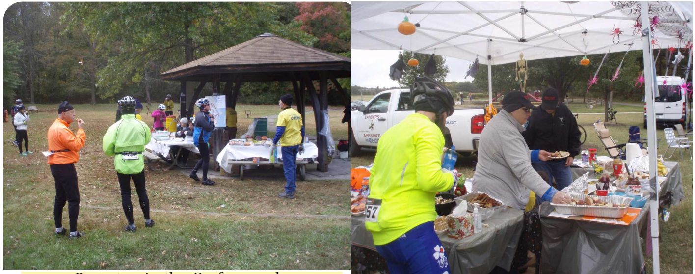
Rest stop in the Crofton park.