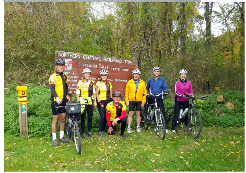
The group at each end of the NCRT in Maryland. We did not ride far into PA.

Fall at its finest was on tap for the annual trail ride to New Freedom, PA. A running Marathon scheduled for the same morning blocked access to the parking lot on Paper Mill Road so the ride started at the parking lot at Sparks, MD and headed North to New Freedom just over the PA border. Along the way we encountered Gnome Hill and its whimsical inhabitants.