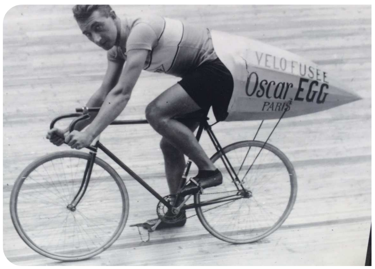
Bicycle legend Oscar Egg demonstrates a device for preventing riders from drafting during speed trials. It may have had other uses such as avoiding pit stops.