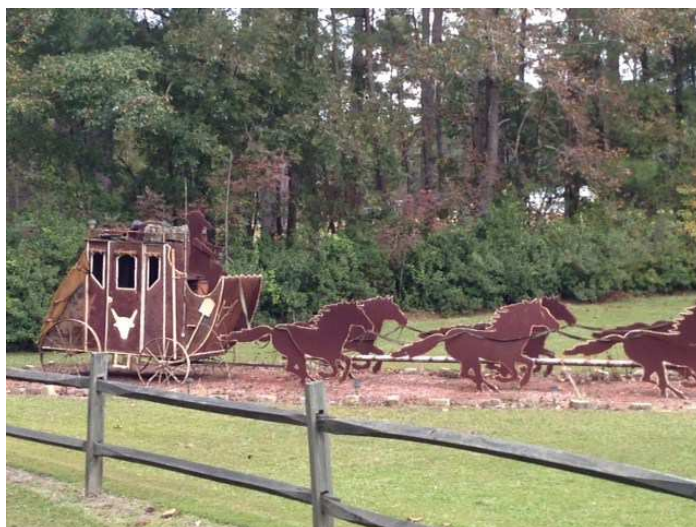
Riding on the old frontier.