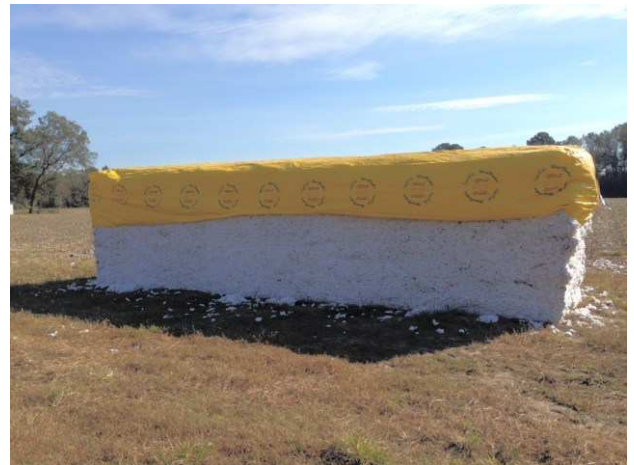
Cotton after picking and bailing.